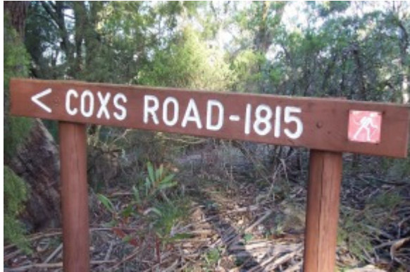
On the old Cox's Rd near Mt York, NSW